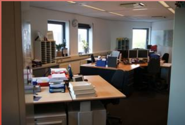
A member of the Herfurth Group